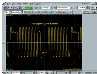
▶ 2.5 Gbps PCI express de-emphasis signal.